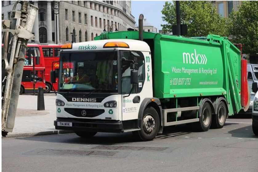
Millbrook/TFL test Dennis Eagle Elite 6 waste truck January 2017

GTL SLASHED NOx in Euro V1 engine exhaust emissions in an urban cycle test by 69.6% allowing the engine to meet the legal requirement of 80mg/km